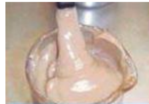
MOV Long Life 1