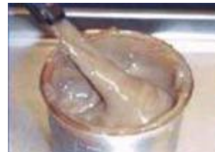
MOV Long Life 0