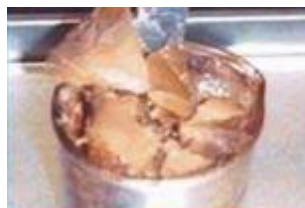
Lithium Diester 2