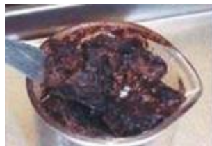
Old Calcium Complex EP0

These photos show examples of these and competitive greases that were aged at an independent laboratory. MOV Long Life and MOV Extra provides much better resistance to age hardening and to stiffening caused by heat. The others were no longer “grease like”.