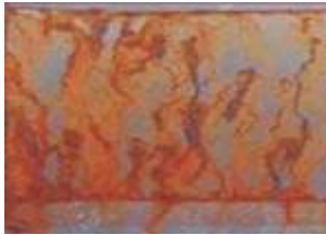
Clay – PAO 1.5