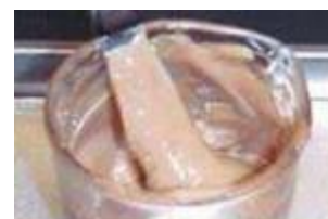
MOV Extra 1

You can go to www.canoilcanadalt.com for more contacts, information, documents and testimonials.