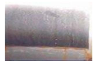
MOV Long Life 0