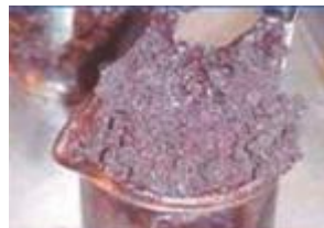
Clay PAO 1.5